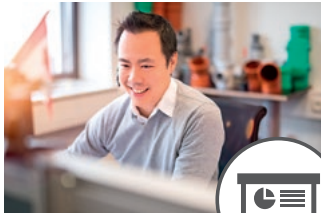
EDI Reception of orders