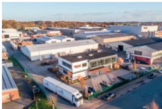
Factory in Vechta