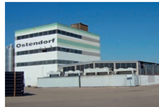
Factory in Rain am Lech