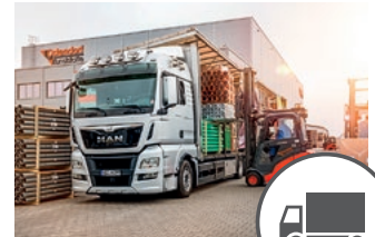
Transport of goods