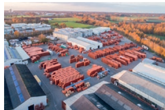
Factory in Emstek